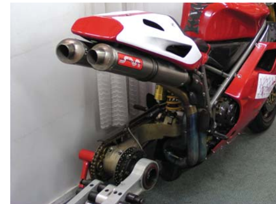
Single Sided Swing Arm adaptor for Ducatis, MVs and Triumphs